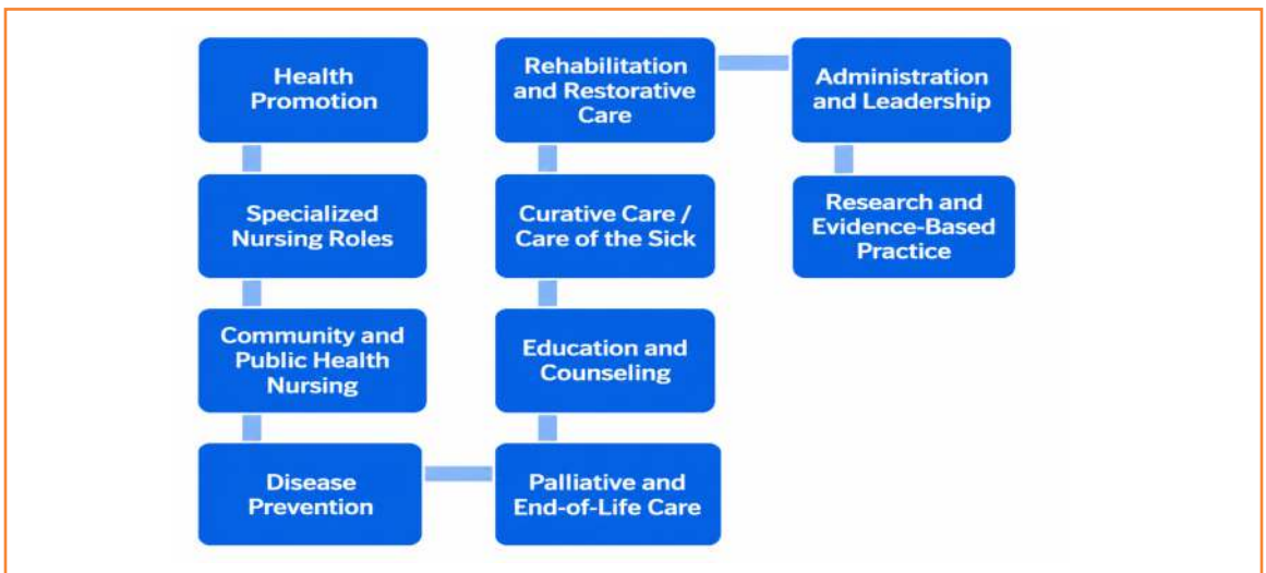
Figure -7 scope of nursing practice

Functions of nurse -The roles of a nurse involve a wide variety of tasks designed to address the health requirements of individuals, families, and communities. These roles highlight nursing as a scientific, holistic, and compassionate profession. They include the following -